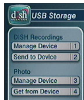
USB Storage Options